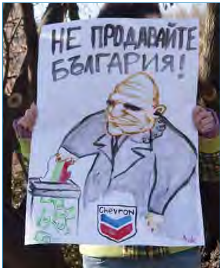
SHALE GAS PROTEST IN BULGARIA.

Poland has the highest estimated reserves of shale gas in Europe, 144 and the country’s government has welcomed the industry with open arms. 145 ExxonMobil, Chevron, Total, Realm Energy and Talisman are among the oil and gas companies seeking to develop