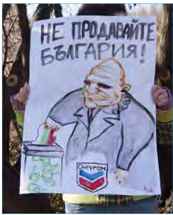
SHALE GAS PROTEST IN BULGARIA.

Poland has the highest estimated reserves of shale gas in Europe,<sup>144</sup> and the country's government has welcomed the industry with open arms.<sup>145</sup> ExxonMobil, Chevron, Total, Realm Energy and Talisman are among the oil and gas companies seeking to develop